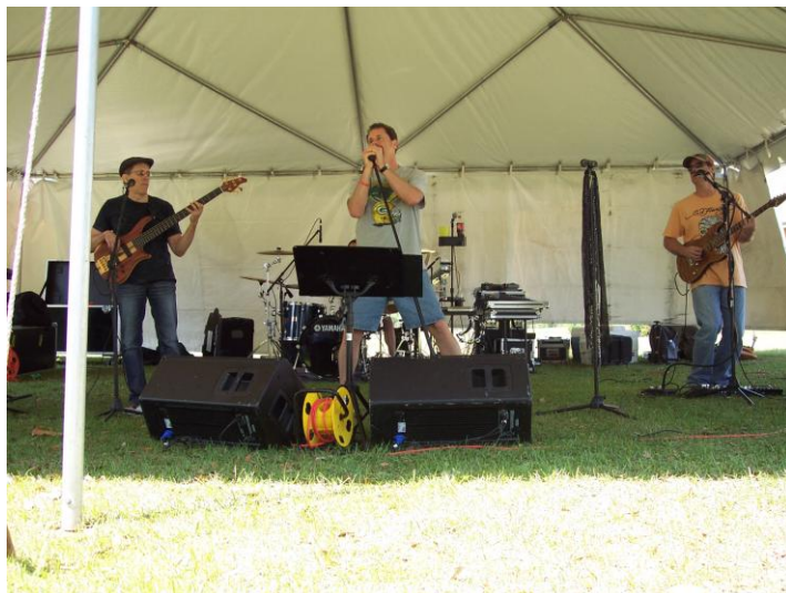
ISIS kept us entertained all afternoon.